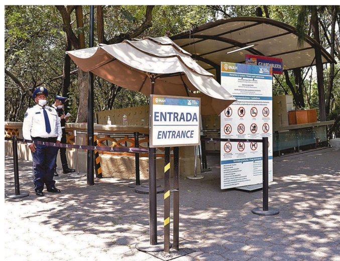
Figure 1. Hygiene control access to the National Museum of History Castle of Chapultepec, one of the most visited venues. One of the main reasons for this is that ventilated most of its spaces [13].

With the above, heritage tourism shows that is not only a vital axis within the national and local economy but can also be an important component as a trigger for the cultural revitalization of communities. The concept of “heritage tourism”, which is a subsystem of tourist activity, is understood as a revitalizing element of cultural patterns in which, not only is given an economic assessment but also a social/cultural community value for the culture/heritage of a particular community. In addition, at the same time, it is important to have in mind and to identify the dangers that the cultural good runs when is used as a tourist item. As already mentioned, it is predicted that local tourism will be the spearhead of the economic recovery of this sector in the immediate future (see Table 1). Although, due to post-pandemic conditions (healthy distance, hygiene controls, and vaccination certificates), nature and cultural tourism (with its variants such as rural, community, or experience) are expected to be in great demand (Figure 1) [12]. In the same way, is important to contemplate and analyze if the value (tourism) put on the heritage contributes to the loss of it by changing the original values of the cultural pattern and with this distorted the heritage into a scenography just to satisfy the tourist activity.