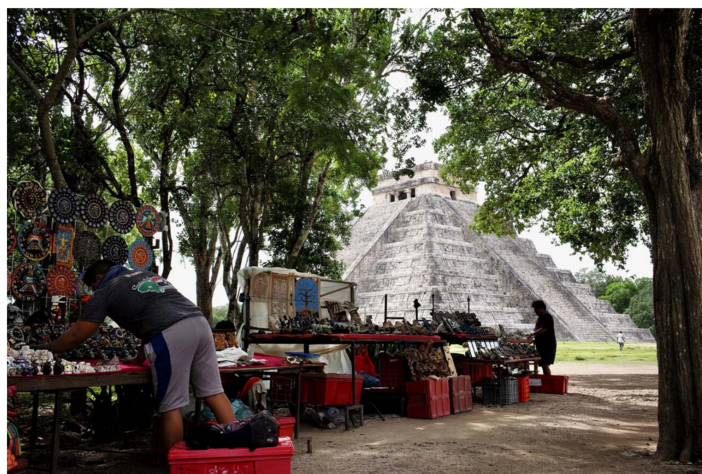
Figure 5. Illegal vendors inside the archaeological site of Chichen Itza, Mexico [47].

legal action (having all the laws in favor) but does not want to make a bigger community problem. Besides that, every year there are more illegal vendors inside, a good percentage of the vendors are not even from the local community, and very few sell local artesanias (handicrafts). Thus, the main problem prevails—is the local community benefiting from heritage tourism? Somebody does. In spite of the COVID-19 pandemic, top archaeological sites and museums continue to be on top (see Tables 2 and 3), although we can see some changes—for example, in the last two years Chichen got more visitors than Teotihuacan because of the pandemic was more severe in central Mexico and the peninsula of Yucatan never closed its borders to tourists.