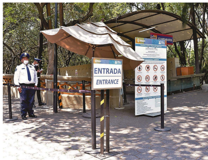
Figure 1. Hygiene control access to the National Museum of History Castle of Chapultepec, one of the most visited venues. One of the main reasons for this is that ventilated most of its spaces [13].

With the above, heritage tourism shows that is not only a vital axis within the national and local economy but can also be an important component as a trigger for the cultural revitalization of communities. The concept of “heritage tourism”, which is a subsystem of tourist activity, is understood as a revitalizing element of cultural patterns in which, not only is given an economic assessment but also a social/cultural community value for the culture/heritage of a particular community. In addition, at the same time, it is important to have in mind and to identify the dangers that the cultural good runs when is used as a tourist item. As already mentioned, it is predicted that local tourism will be the spearhead of the economic recovery of this sector in the immediate future (see Table 1). Although, due to post-pandemic conditions (healthy distance, hygiene controls, and vaccination certificates), nature and cultural tourism (with its variants such as rural, community, or experience) are expected to be in great demand (Figure 1) [12]. In the same way, is important to contemplate and analyze if the value (tourism) put on the heritage contributes to the loss of it by changing the original values of the cultural pattern and with this distorted the heritage into a scenography just to satisfy the tourist activity.