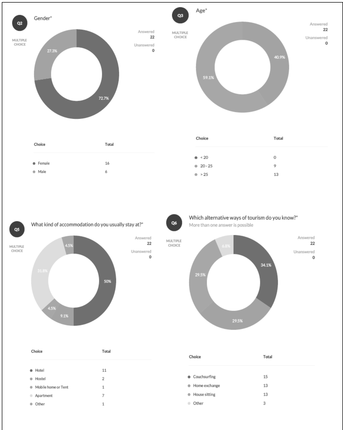
Picture 1. Demography and tourist behaviour