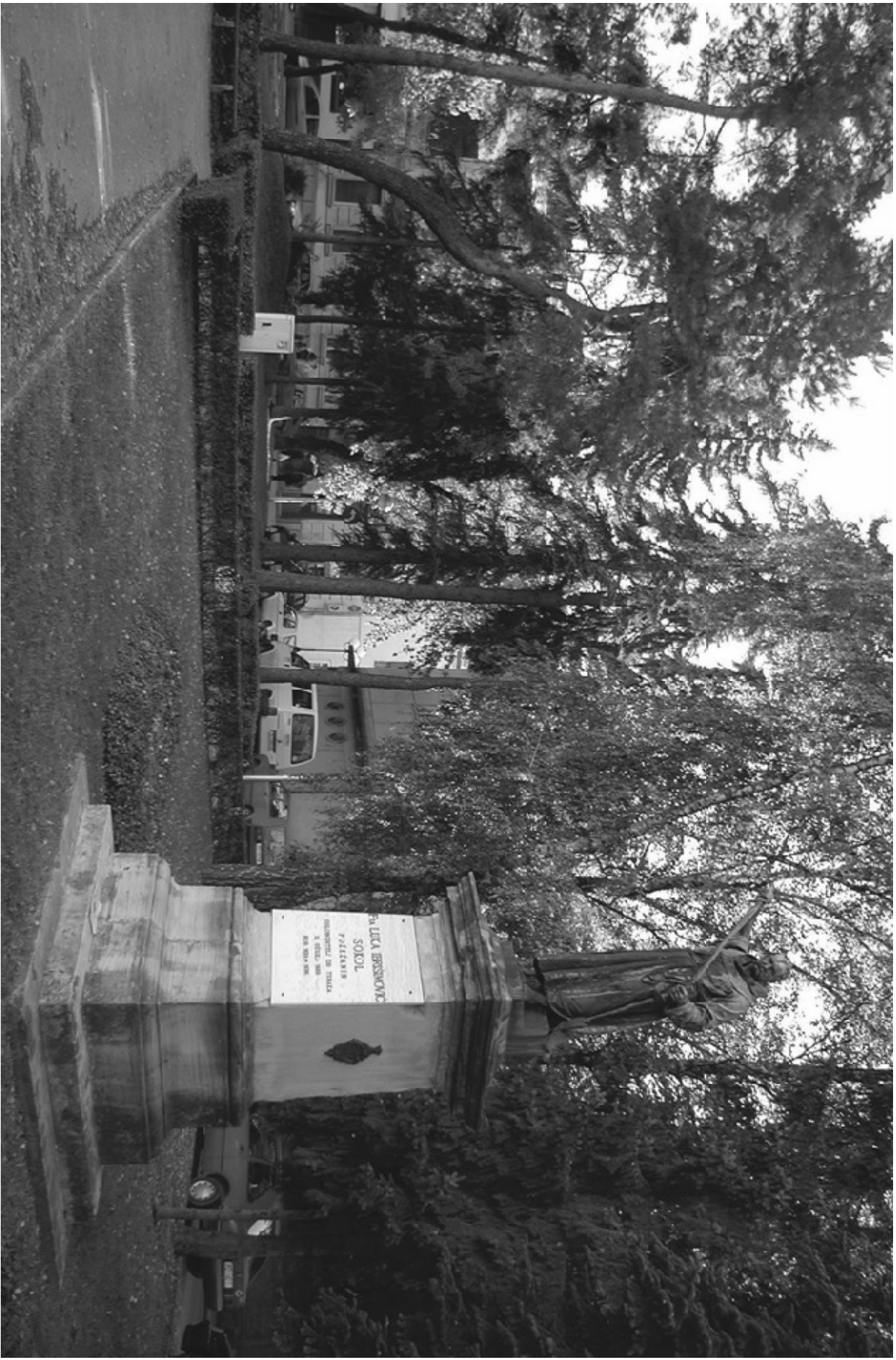
Photo 155. Luka Imbrišimović monument / Spomenik Luki Imbrišimoviću