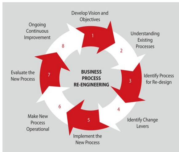
Figure 1. Business process in public administration in Croatia

The participants also defined the related Key Performance Indicators that currently exist, which can be used for measuring, in some way, the efficiency or effectiveness of the processes. The specific business processes that were covered by each taxation flow were defined and a schedule of workshops agreed to cover each of these processes.