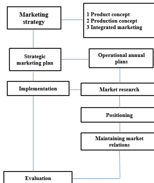
Fig. 2. The structure of the marketing process in a micro-enterprise

In the early 1980s, there was a realization of the need for strategic integration of all marketing communication elements. The disintegration of mass markets into smaller ones, the development of new media, and the rise of consumer sophistication have resulted in a new concept in communication science known as integrated marketing communication. Until 1990, forms of marketing communication were studied and applied individually. However, changes in consumer behaviour caused by general social changes and technological advances resulted in an increasing need to integrate all communication activities and modified and fully customized communication messages. [7]. The essential facts of this term derive from its definition: "Integrated marketing communication is the process of developing and applying various forms of argumentative communication with consumers and potential customers at a given time. The goal is to influence or directly direct the behaviour of selected partners who express interest and use all acceptable forms of communication. The process starts with the potential customer and is directed backwards to develop a permanent process [8]." The ultimate goal is to build a continuous long-term communication process with customers, and this can be done efficiently with the logistical support of Internet technologies.