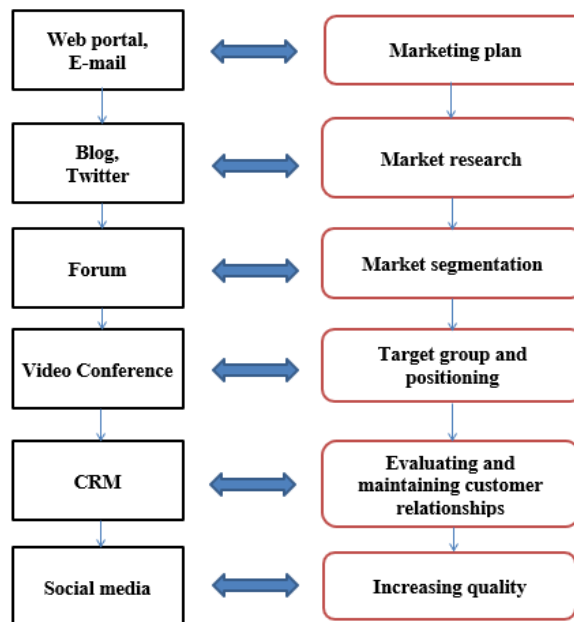
Fig. 3. Integrated information and communication process of marketing activities in a micro-enterprise

Regardless of the company's size, every micro-entrepreneur should organize the necessary information and communication marketing process that will, with the help of Internet technologies, integrate the entire business and thus marketing activities. In this sense, Figure 4 shows a systematic information and communication process in which all marketing activities are fully integrated following the set strategy. The picture shows that the framework marketing plan can be distributed through a personalized web portal and e-mail, which goes to already recognized customers. Market research by collecting data using blogs and Twitter reduces the number of customers, and the forum already determines the market segment. After a video meeting with selected customers from the segment, fascinating customers are selected as the target group. After that, the market capacity of the segment is assessed, and the position or part of the market capacity is determined. Evaluating and maintaining customer relationships is most effective through CRM. Increasing the quality of relationships can take place through social networks. With the proposed process, a micro-entrepreneur can perform all market research activities, i.e. the implementation of a marketing plan, alone with minimal costs.