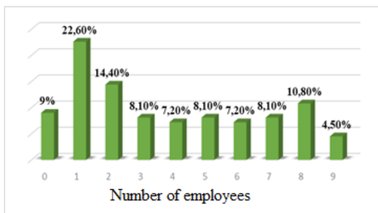
Fig. 1. Number of employees in surveyed micro-enterprises in the Republic of Croatia

The data indicate the relative harmonization of the Micro Entrepreneurship Regulation Act between the Republic of Croatia and the European Union. In addition to the above data, there are research and results on other relevant indicators from which it can be concluded how much is the presence and importance of micro-enterprises in the Croatian national economy. In this sense, Figure 1 shows a survey on the number of employees in micro-enterprises in the Republic of Croatia. The graph in Figure 1 shows that, for example, in 22.60% of micro-enterprises, only one person is employed, and in 69.40%, up to five persons are employed. In any case, one person is responsible for creating and executing all management decisions, usually the business owner.