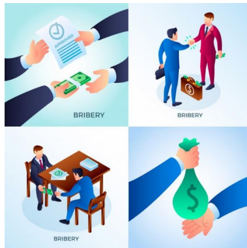
Graph 1: Bribery