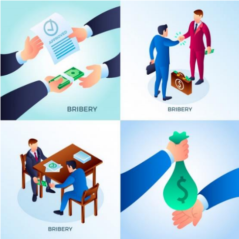
Graph 1: Bribery