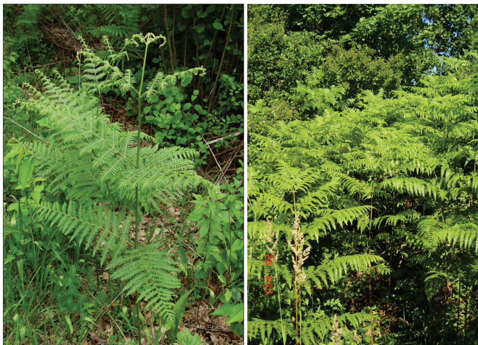
Figure 1 A&B. Bracken fern ( Pteridium aquilinum ) in Papuk Nature Park 1