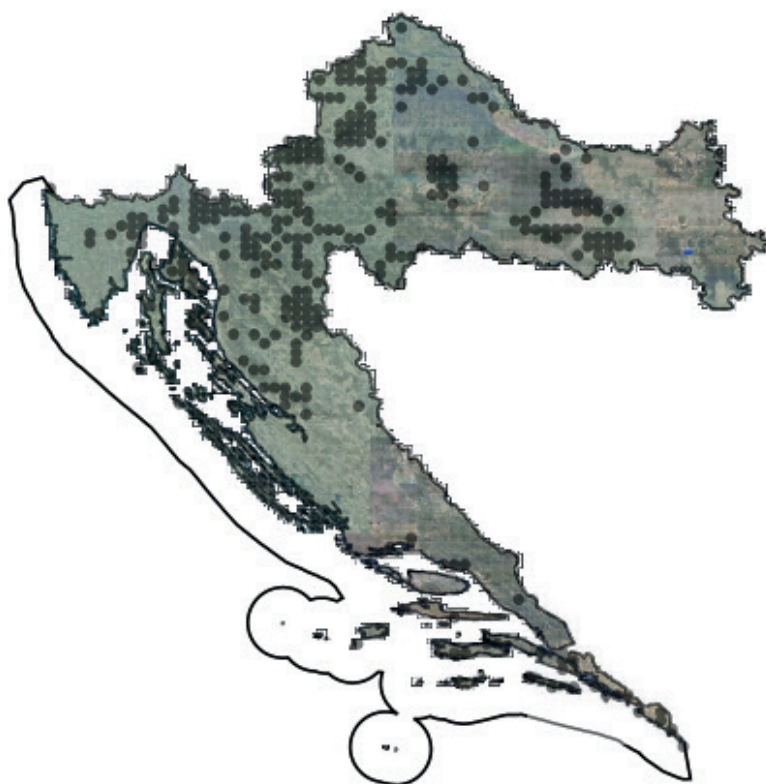
Figure 3. Bracken fern distribution in Croatia