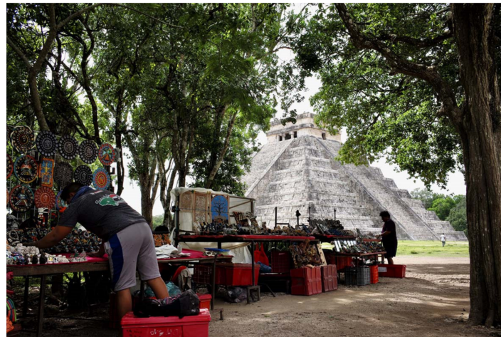
Figure 5. Illegal vendors inside the archaeological site of Chichen Itza, Mexico [47].

legal action (having all the laws in favor) but does not want to make a bigger community problem. Besides that, every year there are more illegal vendors inside, a good percentage of the vendors are not even from the local community, and very few sell local artesanias (handicrafts). Thus, the main problem prevails—is the local community benefiting from heritage tourism? Somebody does. In spite of the COVID-19 pandemic, top archaeological sites and museums continue to be on top (see Tables 2 and 3), although we can see some changes—for example, in the last two years Chichen got more visitors than Teotihuacan because of the pandemic was more severe in central Mexico and the peninsula of Yucatan never closed its borders to tourists.