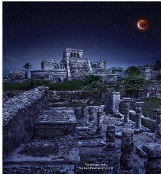
Figure 3. Photographic composition at the archaeological site of Tulum, Mexico [39].