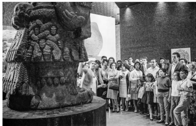
Figure 2. Local and foreign visitors getting a tour visit at the Museo Nacional de Antropología in Mexico City [28].