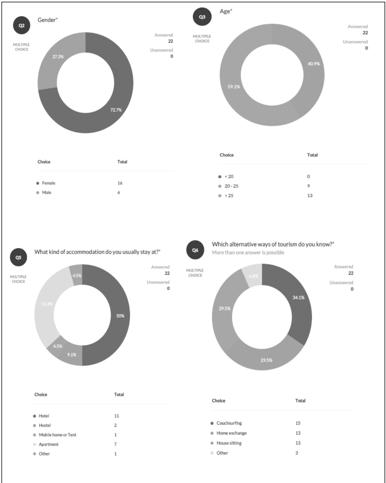
Picture 1. Demography and tourist behaviour